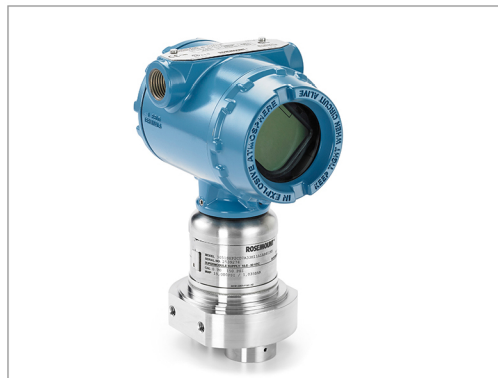
Pump Room / Engine Room Electronic Pressure / Temperature Transmitter & Controller