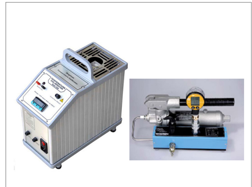
Portable Pressure / Temperature Calibrator