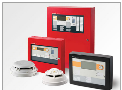
Fire Alarm System