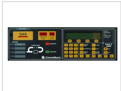
Fixed Gas Detection System