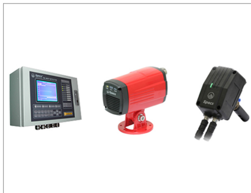
Main Engine / Atmospheric Oil Mist Detector