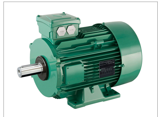
Electrical Motor Rewinding