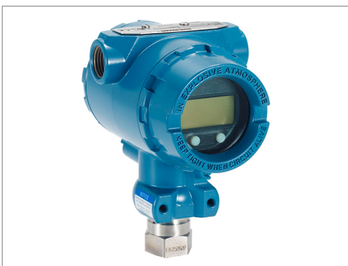
Pressure / Temperature Transmitter