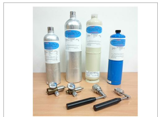
Supply Span Gas