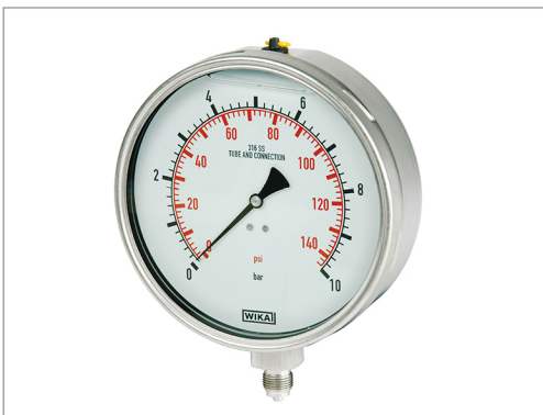
Pressure / Temperature Gauge