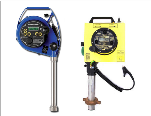
UTI (Ullage Temperature Interface) Tape / Portable Tank Gauging Device