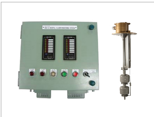
C.O.T. Independent / Bilge Alarm