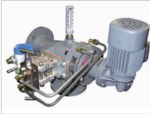
Main / Auxiliary Engine Fuel Oil Viscosity Control