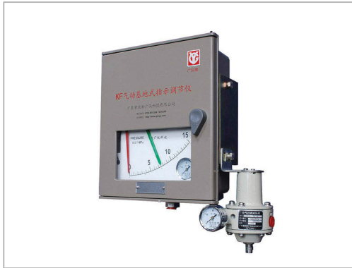
Pump Room / Engine Room Pneumatic Pressure / Temperature Transmitter & Controller