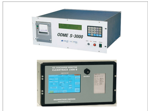
Oil Discharge Monitoring Equipment (ODME)