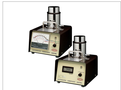
Dew Point Meter