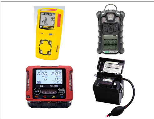
Portable Gas Detector