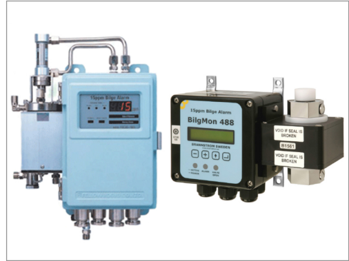
15 PPM Oil Content Monitor